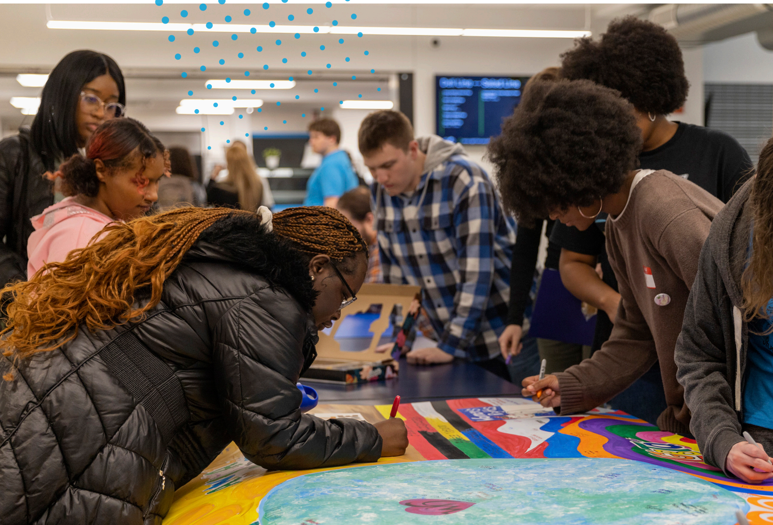
Students from multiple school districts sign a mural celebrating the fourth annual Woodland Hills Student Summit on February 10, 2023.