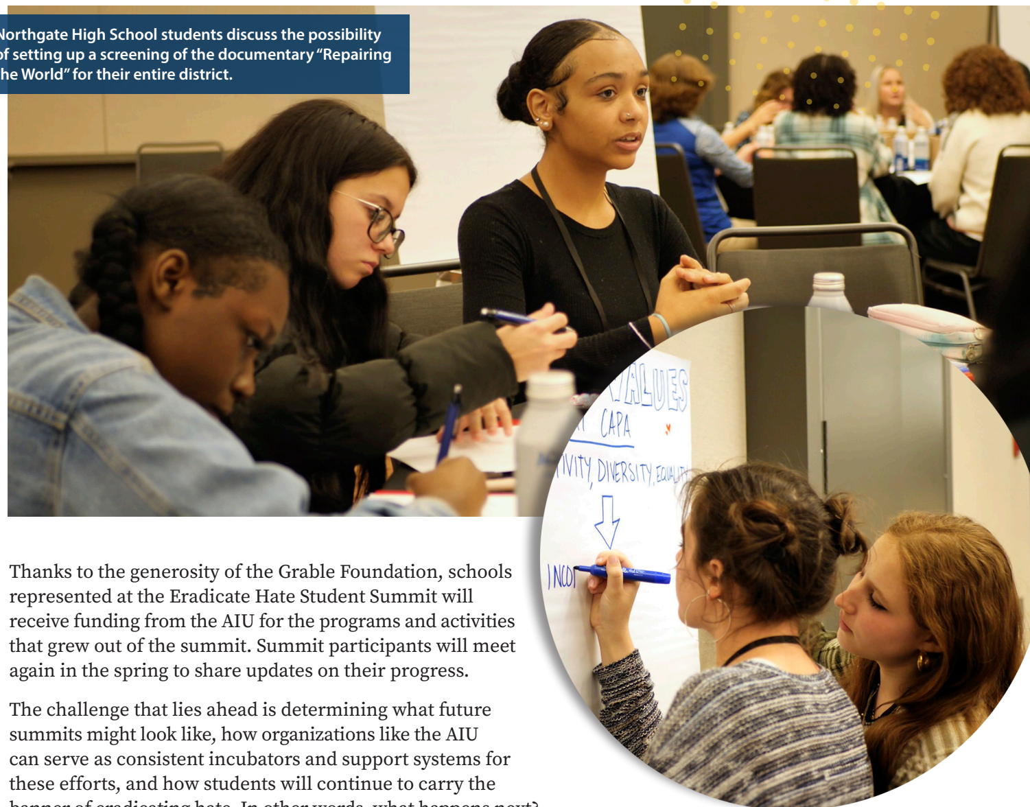
Northgate High School students discuss the possibility of setting up a screening of the documentary “Repairing the World” for their entire district.

Thanks to the generosity of the Grable Foundation, schools represented at the Eradicate Hate Student Summit will receive funding from the AIU for the programs and activities that grew out of the summit. Summit participants will meet again in the spring to share updates on their progress.